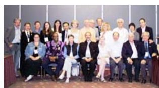
The new advisory board of the WAS meets for the first time in Montreal on July 13th, 2005

sented, a strong representation and balance of continents, countries, professional background and gender was achieved. A powerful team to make significant advancement in the fulfillment of the WAS mission.