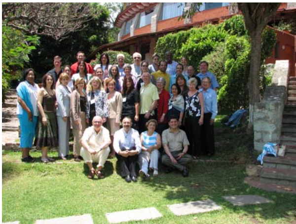
Sexual Health Consultation Group in Oaxaca, May 2006

During a Sexual Health consultation held in Oaxaca, Mexico, experts from around the globe examined the evidence that points to the burden that sexual ill-health represents for Global Development.